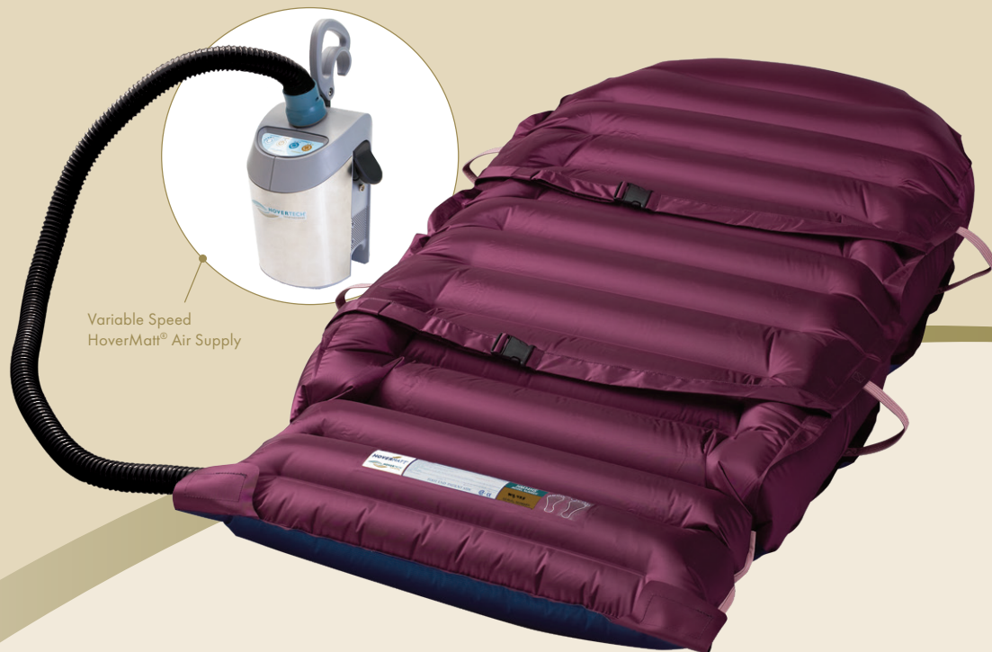
Variable Speed HoverMatt® Air Supply

The HoverMatt® air transfer system is the number one choice of hospitals for lateral patient transfers and patient repositioning. When inflated, a cushion of air beneath the mattress enables caregivers to safely transfer patients without lifting or straining. By reducing injuries related to lateral transfers and repositioning, the HoverMatt® air transfer system helps to improve staff retention while meeting legislative guidelines for safe patient handling.